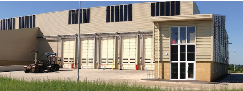
Hills Northacre Resource Recovery Centre, Wiltshire, UK

With the vision and cooperation of the Berkeley County Council and the Berkeley County Solid Waste Authority, Entsorga West Virginia introduces a “clean” technology solution which will change the future of waste disposal in West Virginia.